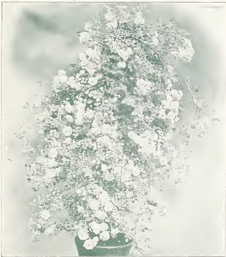
LADY GAY ROSE